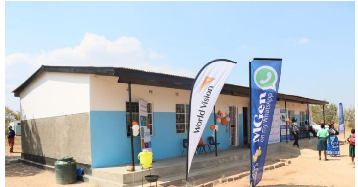
1x2 classroom block at Mpande Primary School was refurbished by World Vision Zambia in partnership with Madison General Insurance.