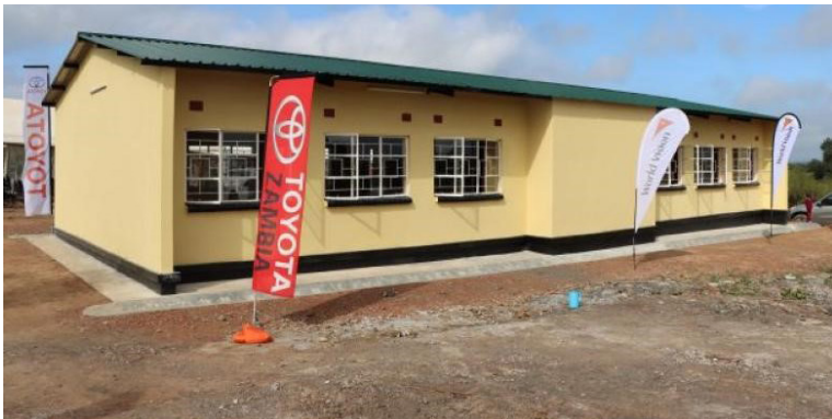
1x2 classroom block at Hippo Community School was constructed by Toyota Zambia in partnership with World Vision Zambia