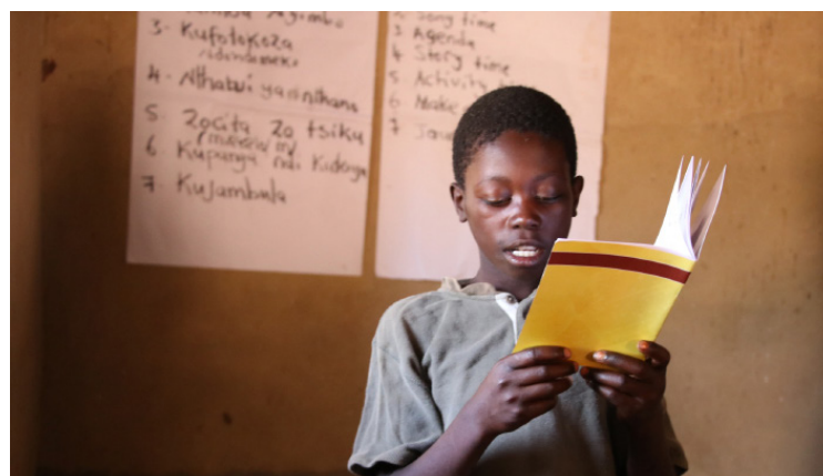
Rabson participating in Unlock Literacy Reading camp in Nyimba District, Eastern Province

and Reading Camps which are weekly sessions for Grades 1-4 students who live in the same communities. Reading Camps are designed to be outside school learning sessions to complement what children learn in school and in addition develop a love for reading. In some cases, out of school children have also joined reading camps. Reading Camps are managed by RCFs who are trained by World Vision Zambia. We have currently established 1,071 Reading Camps and trained 710 RCFs. We have trained 5,482 parents in Reading Awareness workshops. The training has equipped parents and caregivers with knowledge and strategies to support their children’s literacy development more effectively.