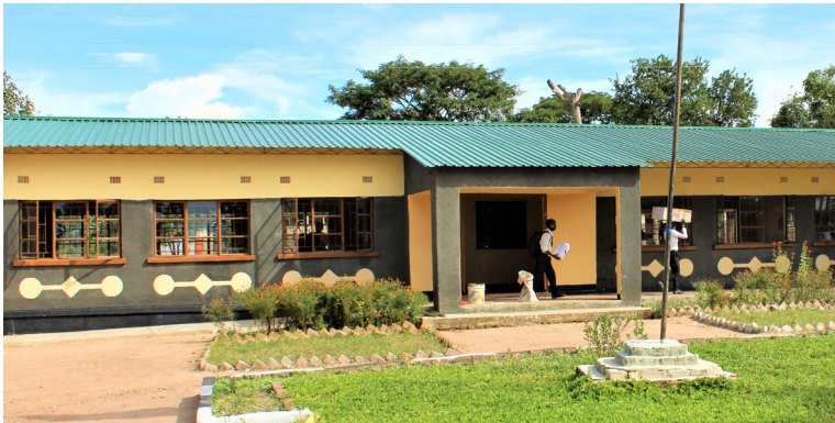
Milando Primary School classroom block in Mungwi District was constructed by Cfao Motors in partnership with World Vision Zambia