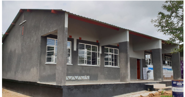
Chipapa Secondary School classroom block in Lusaka Province was constructed by Absa Bank in partnership with World Vision